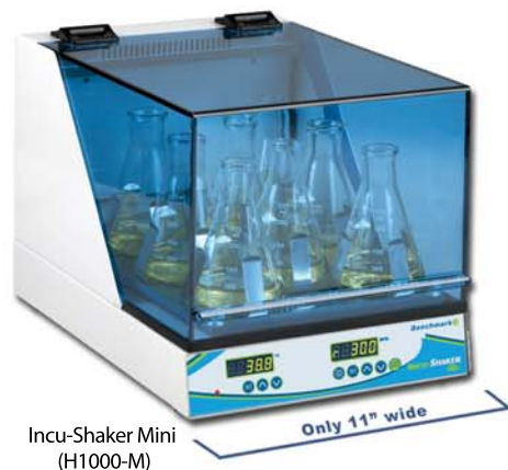
Incu-Shaker Mini (H1000-M)

Temperature, shaking speed and run time are displayed on the large LED control panel located on the front of the unit. The integral microprocessor includes a constant monitoring system that verifies and maintains accuracy through the duration of the program. Sophisticated over-temperature and over-speed controls ensure long life, safety and sample integrity.