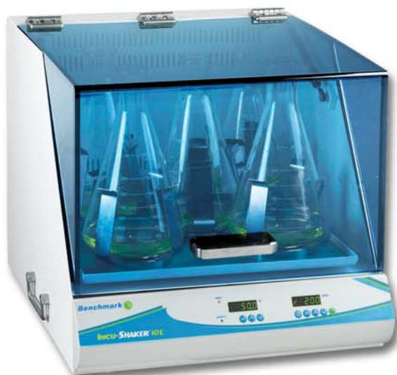
Incu-Shaker 10L (H1010)

The new Incu-Shaker™ series of shaking incubators provide digitally regulated temperature with precisely controlled, circular (orbital) mixing, optimized for the culture of a wide variety of cell types.