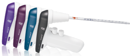
accu-jet® S pipette controller