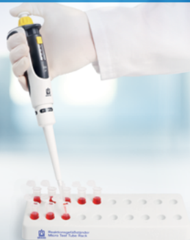
Transferpette® S single channel pipette

Transferpette® S, accu-jet® S, and Dispensette® S