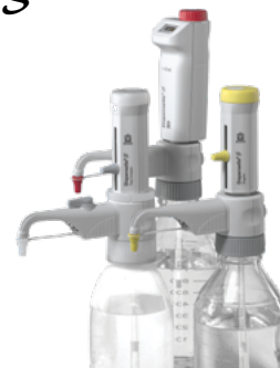
Dispensette® S bottle top dispenser